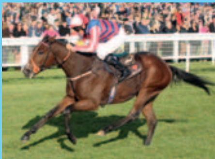
The Tweenhills bred and consigned Tell Dad makes all to land the Horris Hill Stakes (Gr.3)