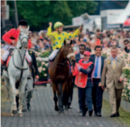
Dunaden claims a narrow victory in the Melbourne Cup (Gr.1) for Pearl Bloodstock