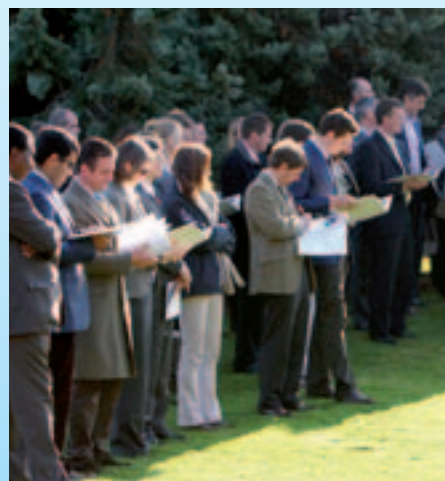
Sheikh Fahad Al Thani and various trainers enjoy the annual Pearl Bloodstock parade at Tweenhills on 13th November